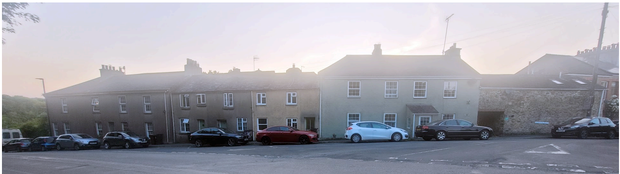
Above: Beacon View buildings with Clarence House on the right. Below: Nos. 29 and 29a Church Street