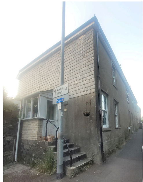
The house with the steps at the end of Beacon View

"the first house with the steps going up is definitely haunted by a bad spirit! I stayed there when my friends lived there I have never been so scared by a entirety in my life!"