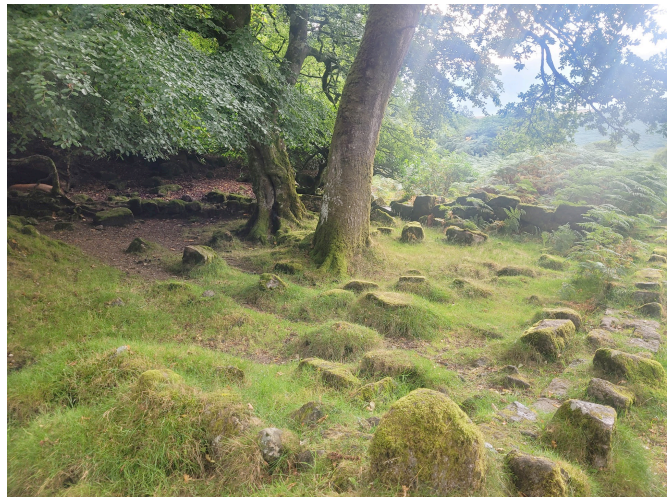
The ruins of Brentmoor House

One evening at dusk, me and my husband where returning from a late dip at Jack in the Box when we approached the narrow just after the ruins. We where instantly stopped in our tracks my a loud, low "woof woof woof"! We didn't know what to do. I picked up a stick in fear and, when nothing came towards us, we proceeded down. Didn't see any foot prints or saw or heard anything more!"