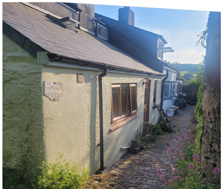
Lutton Cottages (June 2023)

“I remember being woken one night and seeing a fire at the top of the stairs: ghost fire!”