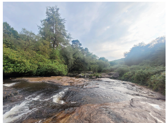
The River Avon near Shipley Bridge (author's photo, August 2022)

"a well hidden bridge at the end of a long road that leads out of South Brent and ends up at Avon Dam (although you can't drive past the Shipley Bridge car park). The River Avon crashes beneath the bridge on its way to the English Channel at Bigbury Bay."