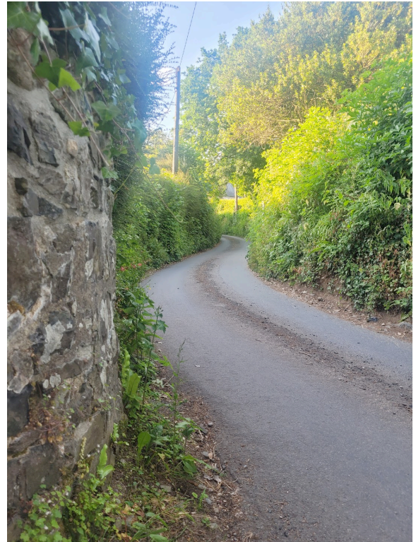
The road up to Lutton (author's photo, June 2023)

However, my mum's spooky experience on the same hill in the 1950s turned out to have a rational cause. She was traversing the steep path in the pitch dark when an eerie light appeared that bobbed up and down. Before long she realised it was a bicycle's headlamp.